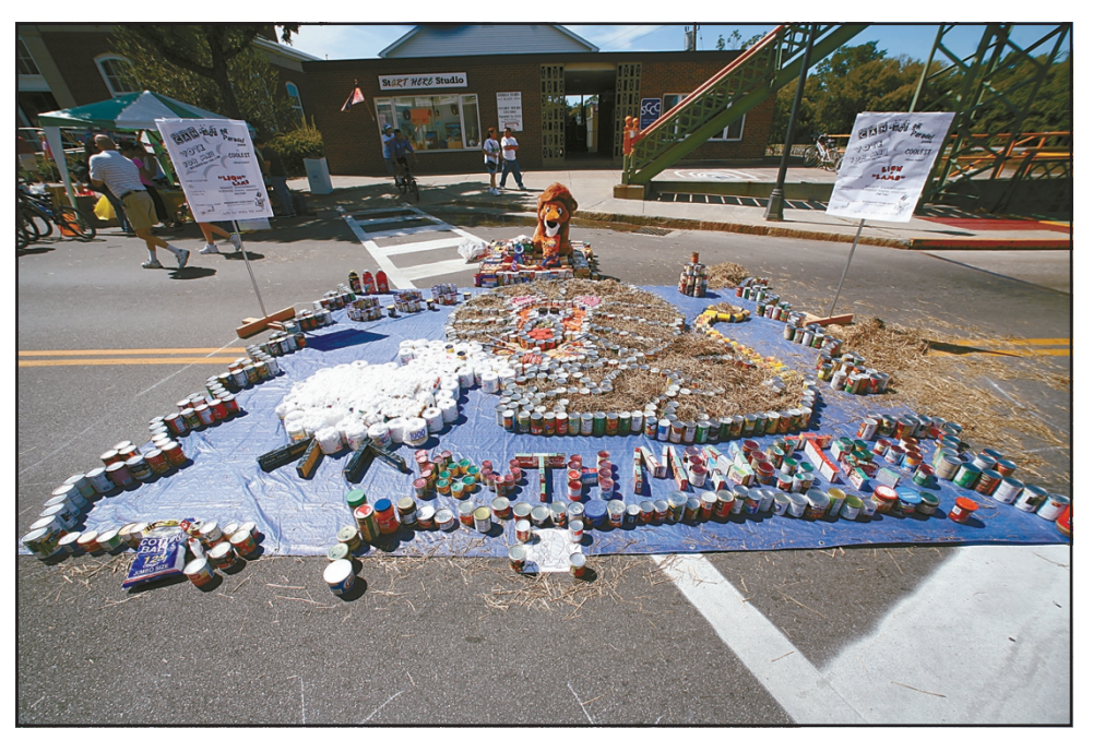
"Lion" was a first time sculpting effort for the Christ Community Church Youth Ministry Blue Team.