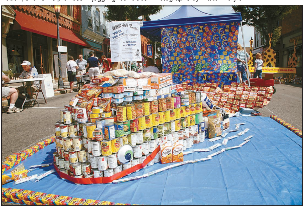
"A Whale of a Time," assembled by a sculpting team from the Clarkson Community Church, greeted fest goers at the west end of Market Street.