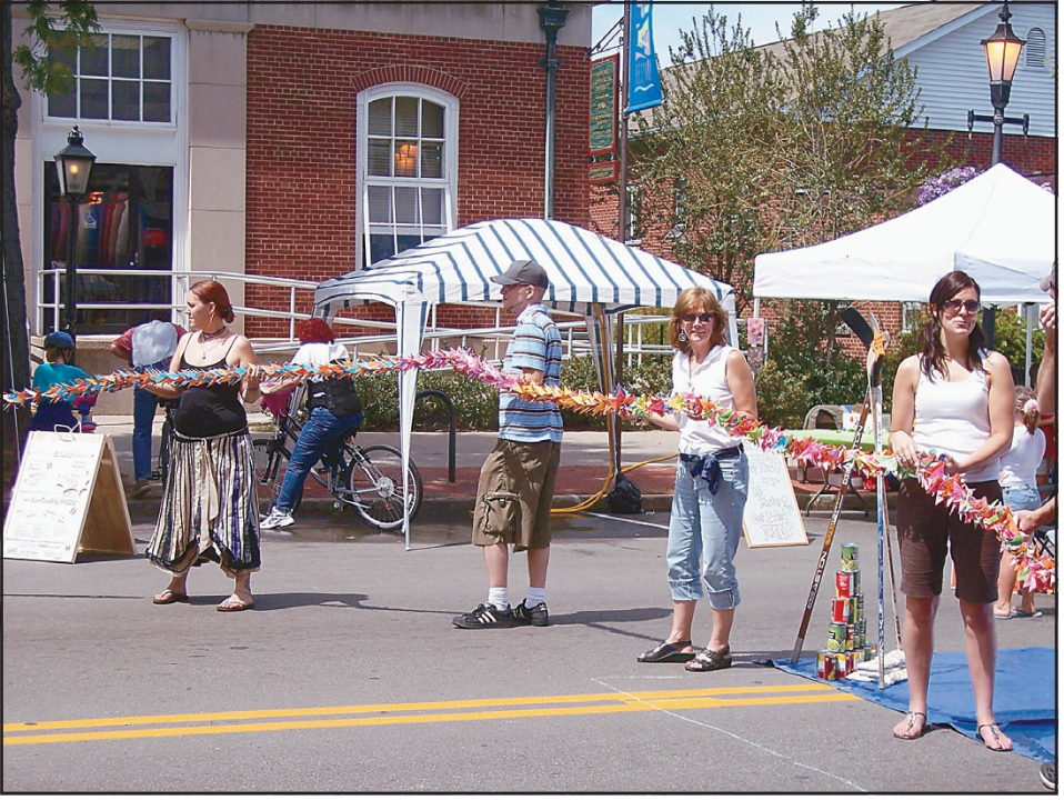
The Gigantic Cool Kids Peach Chain was made up of over 5,000 origami cranes. This year marked the 5th Cool Kids Day.