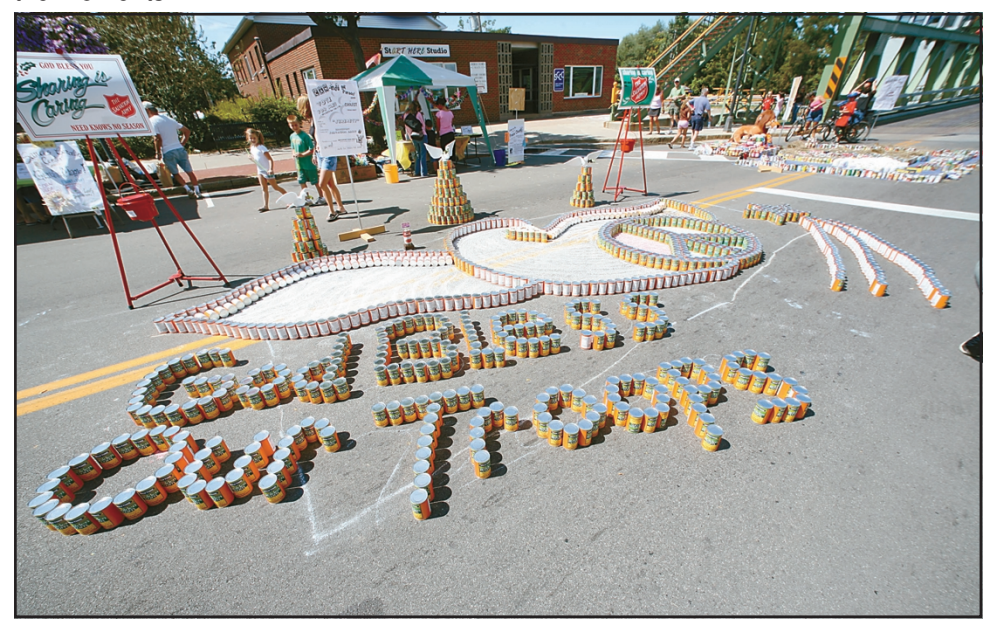
The Brockport Salvation Army was responsible for this creative assemblage called "Serenity." This years can total was 16,100, Appleton reported, up from 12,000 last year.

Just so 'Cool' -- More than a dozen sculptures each made with 1,000 cans paraded down Brockport's Main Street during Cool Kids Day, August 12, a part of the Art Festival. Organizer Steve Appleton also coordinated the display of a Cool Kids Peace Chain made of over 5,000 origami cranes created from art paper, bubble gum wrappers, tax forms, homework assignments and all types and sizes of paper by people from all over (below right). Area food shelves profitted from the Can-imals creations and the crane chain was its own powerful statement for peace in the world. Westside News freelance photographers Walter Horylev and Rick Nicholson helped capture the moments.