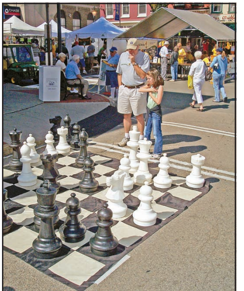
Or, others could play some chess on the supersized version.