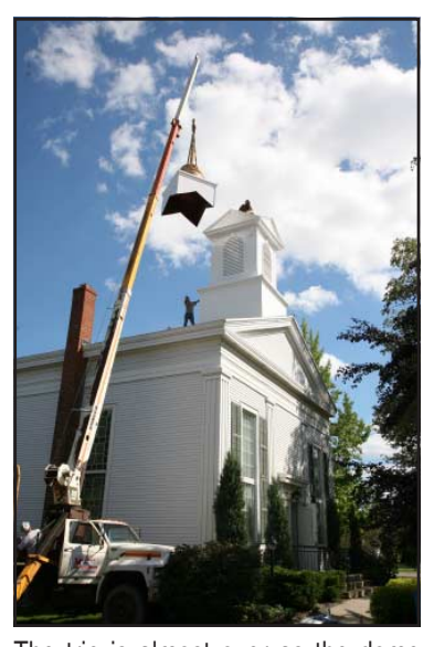
The trip is almost over as the dome approaches the cupola, under the direction of a worker on the roof.