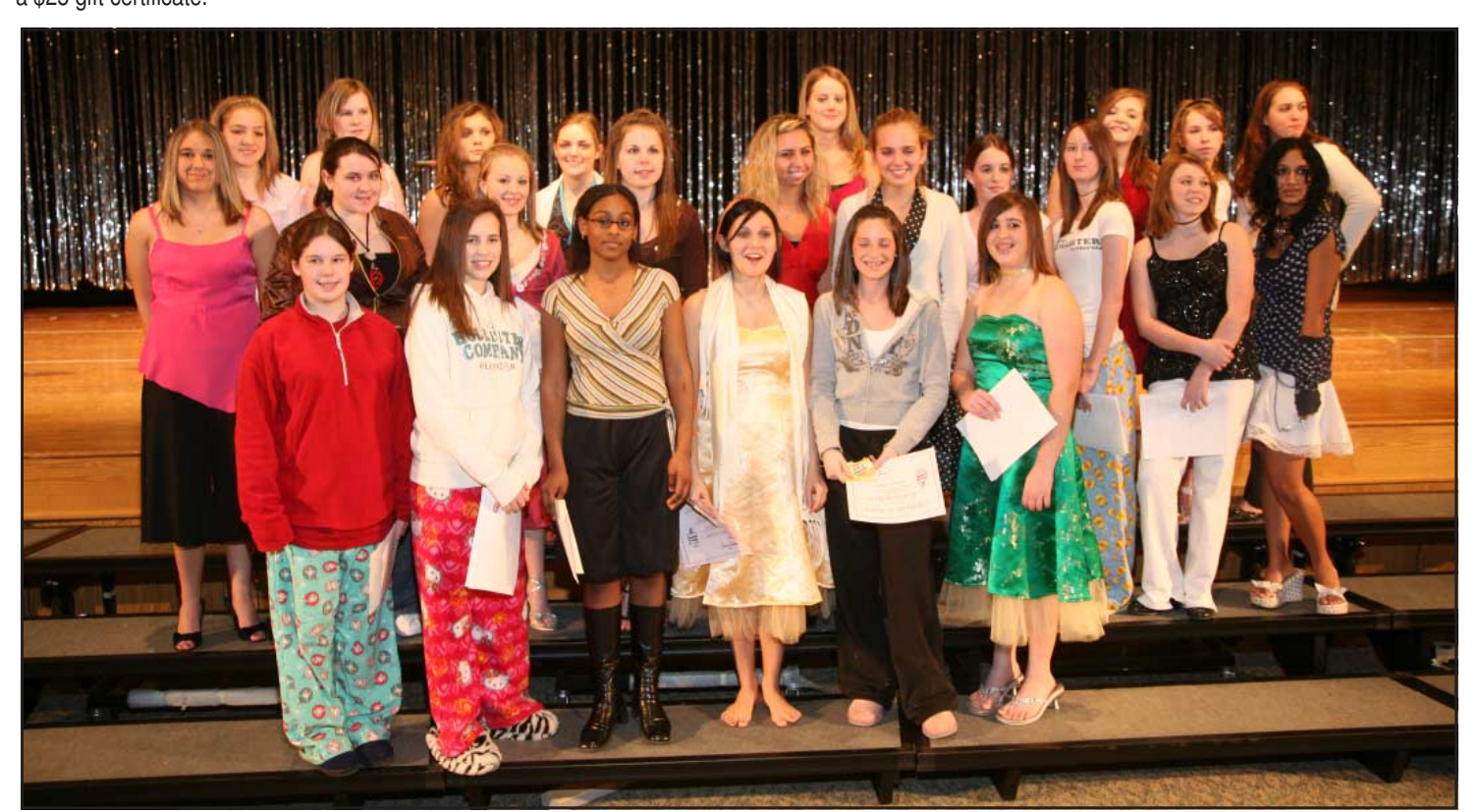
Students and models line up after the fashion show, the participants displayed a number of well-crafted, attractive garment styles and a presentation that indicated they learned how to walk with a certain amount of flair.