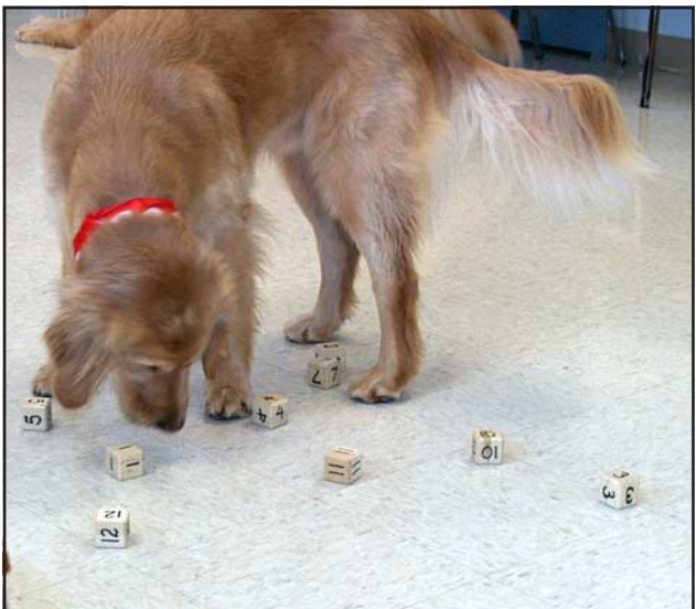
After spreading some numbered blocks on the floor, Barb asks Puma , "What is three times four?" Puma searches the blocks, finds the 12, and brings it to Barb.