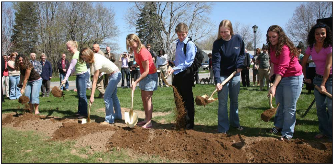
Students also got into the spirit of groundbreaking Thursday, April 20.