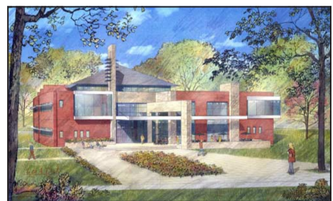
Architect's renditions of the interior and exterior of the new library on the Roberts Wesleyan College campus in North Chili.